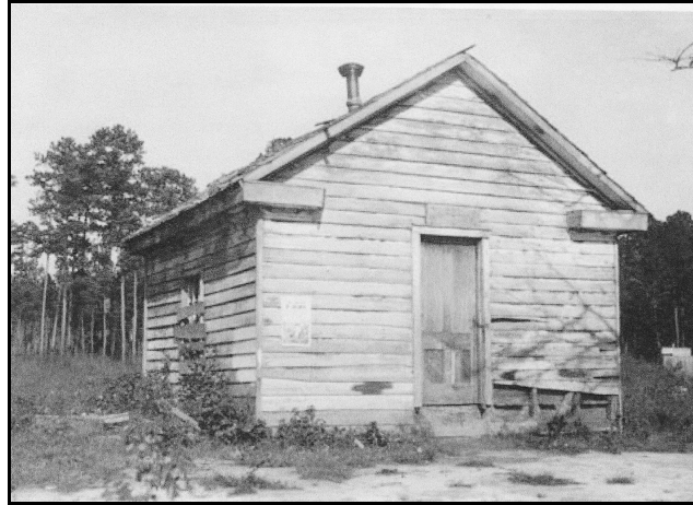
Christian Home, pre 1924