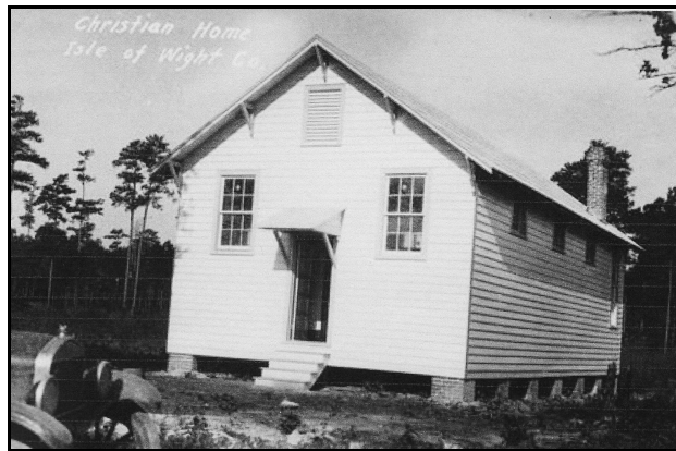
Christian Home School, built 1924.