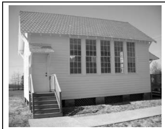
Schoolhouse Museum, 2007